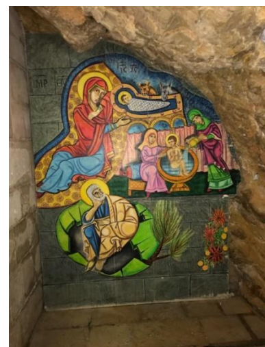
Grotto at St Anne's Church